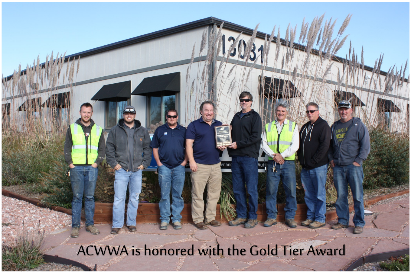
ACWWA is honored with the Gold Tier Award

Congratulations! to ACWWA's Field Operations team on achieving the Gold Tier Award in Colorado