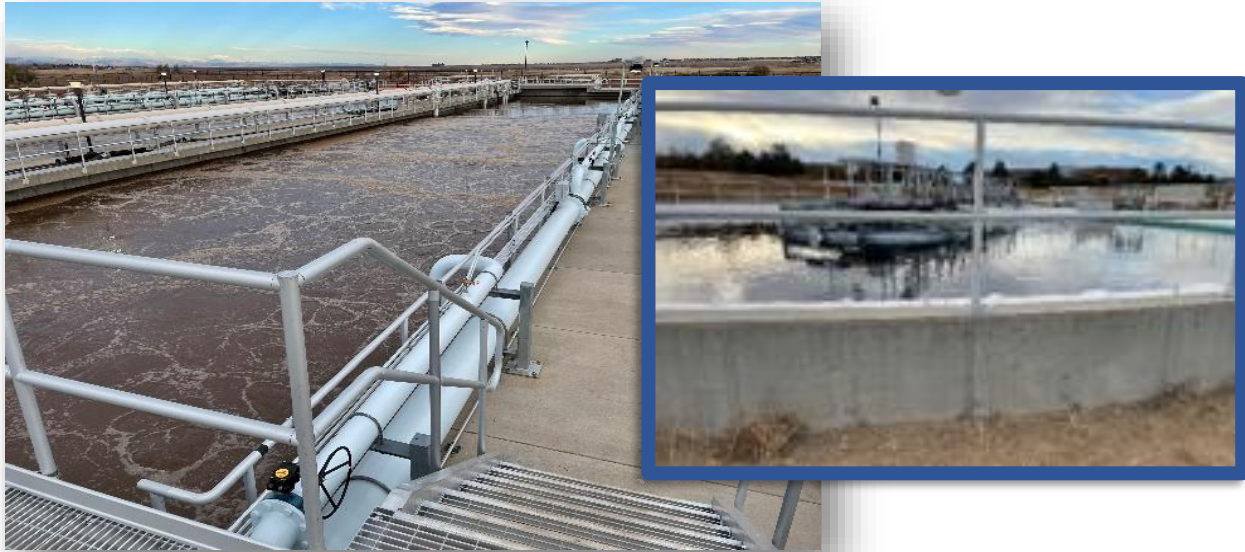
LTCWRF Newly Equipped 3rd BNR

In October 2021 the 3 rd BNR and clarifier were equipped and successfully completed, and in early November the 3 rd train was brought online. The completion of this project has provided the necessary redundancy to allow routine scheduled maintenance on the BNRs and secondary clarifiers. All trains will be cleaned on a rotating five-year basis, keeping the BNR functioning at maximum efficiency.